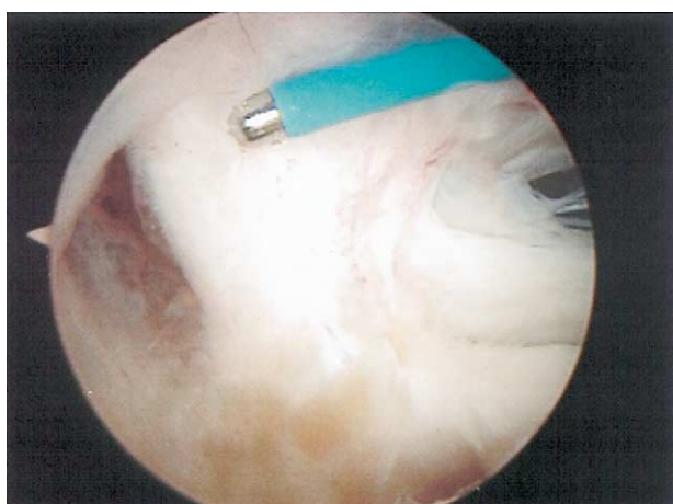
FIGURE 1. Shown is the thermal probe shrinking the glenohumeral capsule in the region of the rotator interval. Care must be taken to avoid the tendinous portion of the subscapularis.

At the conclusion of the procedure, the humeral head appeared to be seated in the glenoid and the glenohumeral capsule was tightened from inferior to posterior and then anterior to superior, including the rotator interval. All of the instruments were then removed and the wound was copiously irrigated with